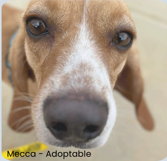
Mecca - Adoptable

Welcome to the February edition of LOHS Paw Print! We're thrilled to kick off the new year by welcoming a cherished new veterinarian to our team, whose expertise and compassion will undoubtedly enhance our care for the animals. This month, we're celebrating numerous happy tails, diving into the latest community numbers, and gearing up for our much-anticipated Spay-ghetti dinner fundraiser. Stay tuned for heartwarming stories, important updates, and ways you can get involved in making a difference!